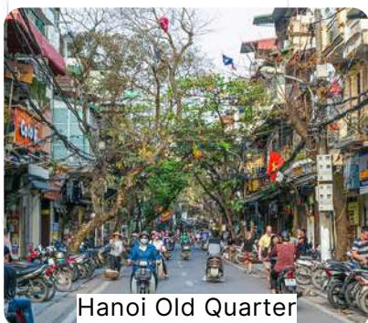
Hanoi Old Quarter

Distance Noi Bai Airport – Hanoi Central: 35 km => 45 minute transfer