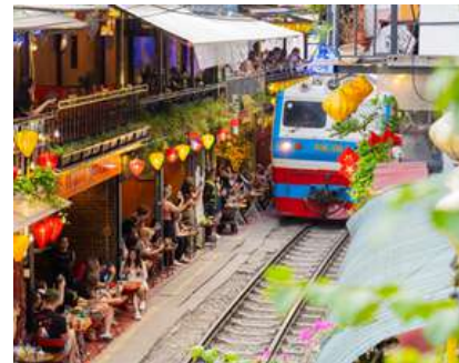
Train Street Coffee