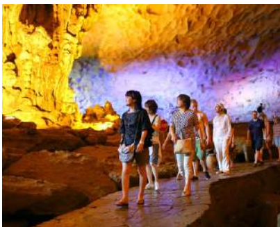
Thien Cung Cave

Distance Halong – Hanoi Central: 165 km => 4 hour transfer included break