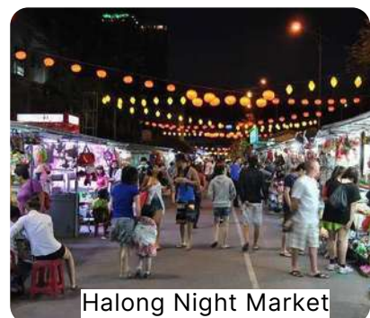
Halong Night Market